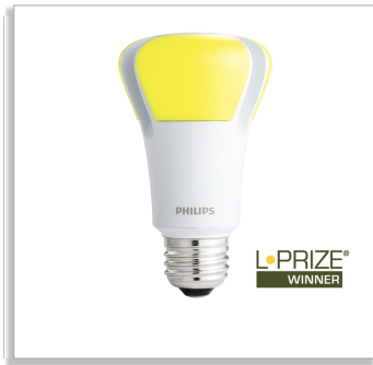
L Prize Winning LED